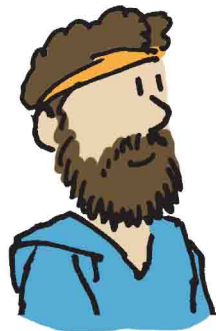
Esau skillful hunter

Circle the 3 things that relate to each brother.